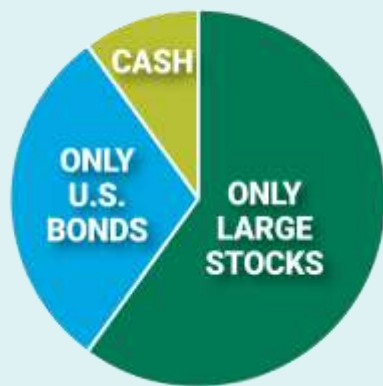
Still Not Diversified